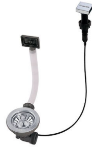
LIRA automatic waste fitting 8407 102